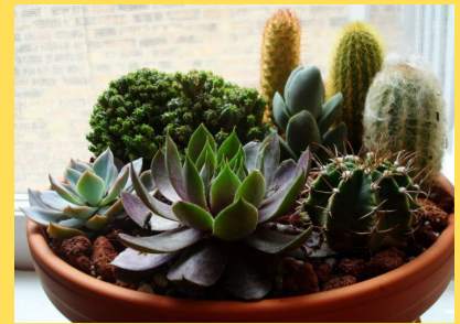
Succulent Container Garden April 22