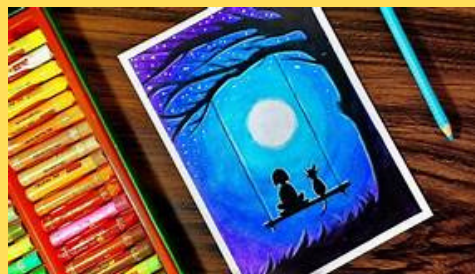
Chalk Art April 21

PRE-REGISTRATION is required for ALL activities.