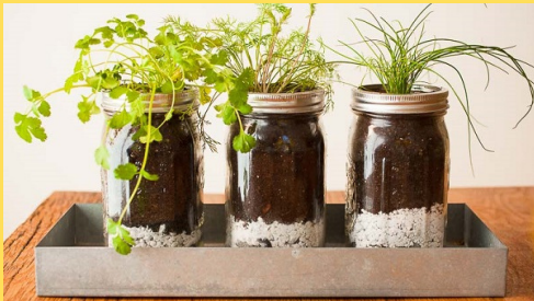
Herb Garden April 8